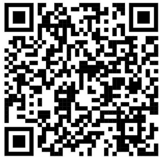
Representing Other Club/Teams Request